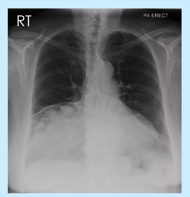
72y/o female short of breath with cough. Recent long haul flight. Raised D-Dimer. No previous CXR

Q1: Briefly describe any abnormal findings