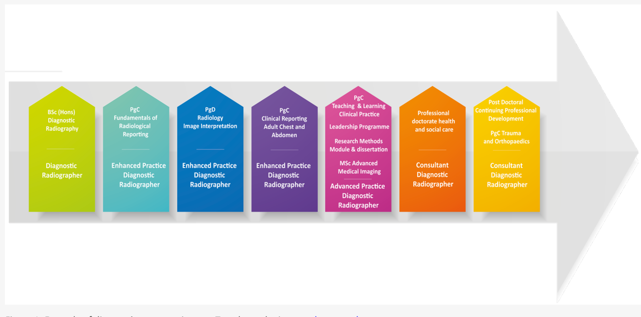
Figure 1: Example of diagnostic career trajectory. To enlarge the image, please see here.

Multiprofessional AHP frameworks for the UK devolved nations complement the CoR Education and Career Framework. There is an expectation outlined in all the frameworks that diagnostic radiographers working at advanced level will achieve at least master's (level 7) training and awards and that consultant radiographers will achieve doctoral (level 8) training and awards. Level 7 and 8 training and education support advanced and consultant radiographer practice, which consists of four core domains: clinical practice; leadership, management and consultancy; education; and research. For an example career trajectory, see Figure 1 below.