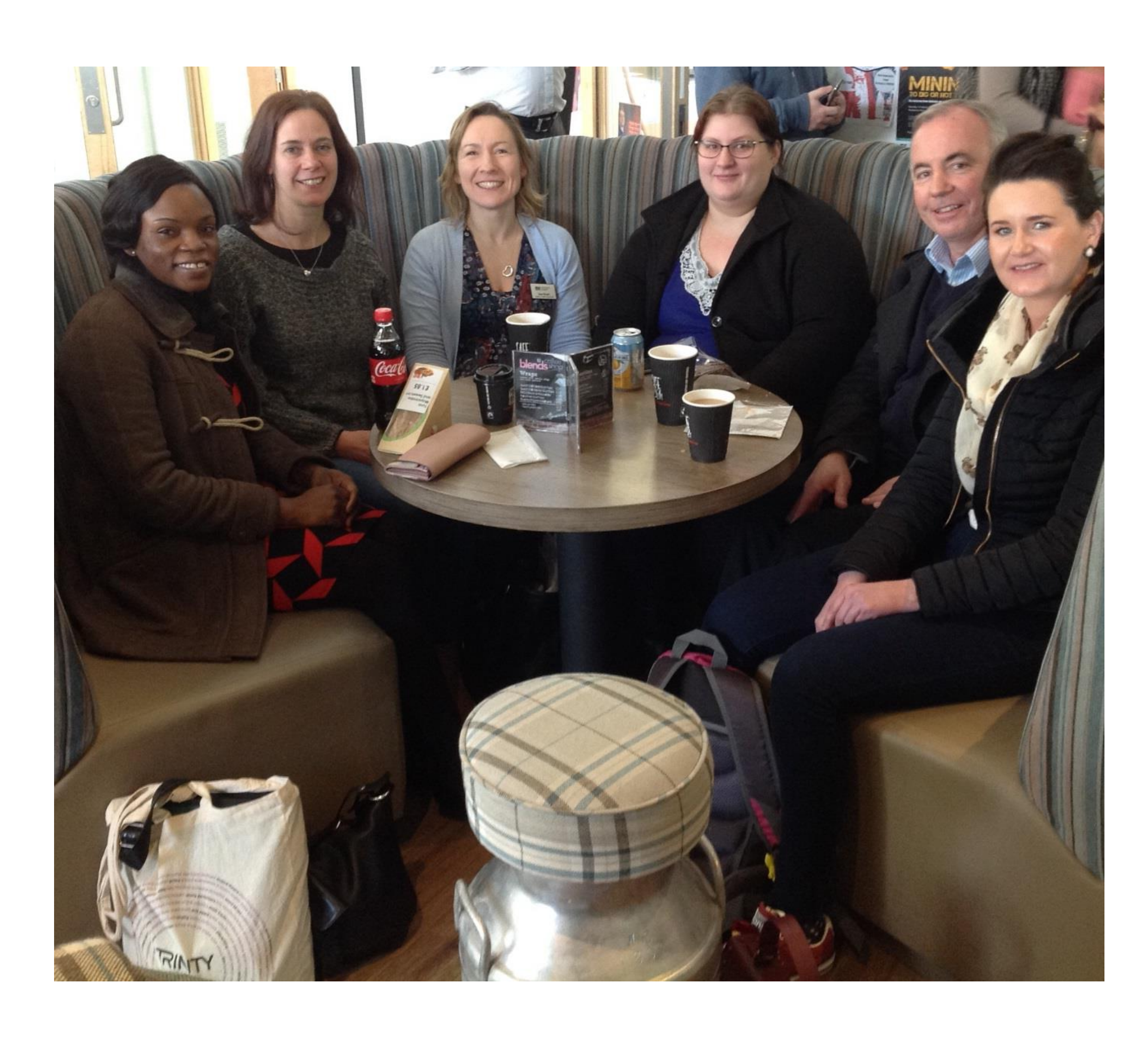
Fig 1 – The March 2016 cohort

Corresponding author: S.Errett@derby.ac.uk Tel: 01332 593068