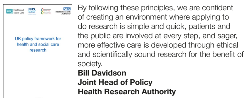
Figure 3: UK Policy Framework for Health and Social Care Research, Health Research Authority (2017).

The Research Governance Framework has now been replaced by the UK Policy Framework for Health and Social Care Research . The new framework includes 19 principles of good practice for the management and conduct of all health and social care research.