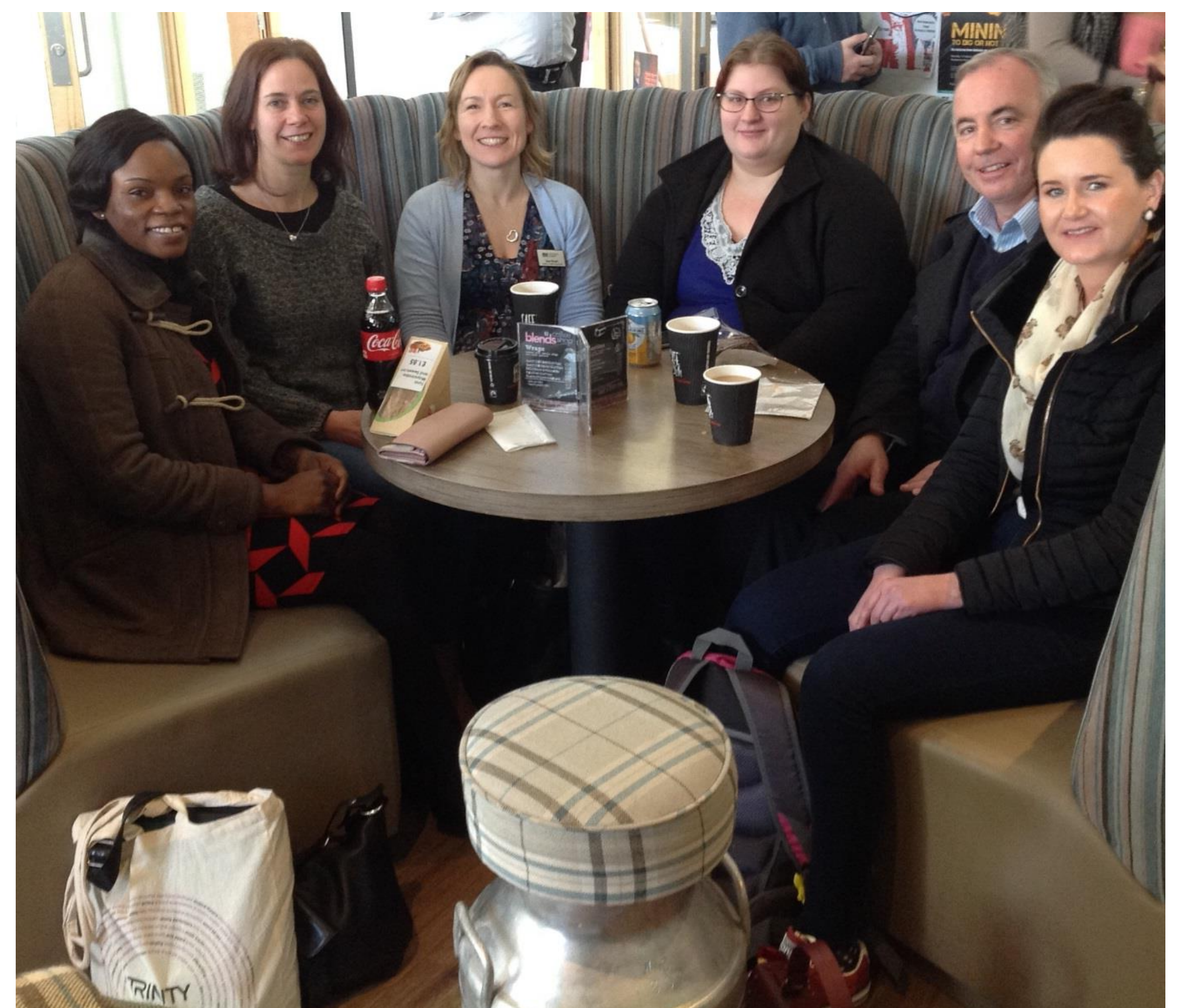
Fig 1 – The March 2016 cohort

Corresponding author: S.Errett@derby.ac.uk Tel: 01332 593068